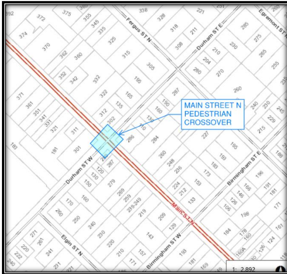
Figure 1: Pedestrian Crossover Main Street N at Durham Street

333 Smith Street, Arthur (catered by Steve Chambers of A+ Catering)