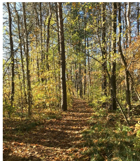
The River Trail, Arthur.

Jack was involved with the Grand River Conservation Authority (GRCA), and along with a group of local volunteers under his direction after hours they planted trees, built a bridge, put up bird houses as well as mason bee habitats. The trail has been constantly used and has the locals cutting grass and helping maintain it. It is accessible off Wellington County Road 16 at the south side of the lake.