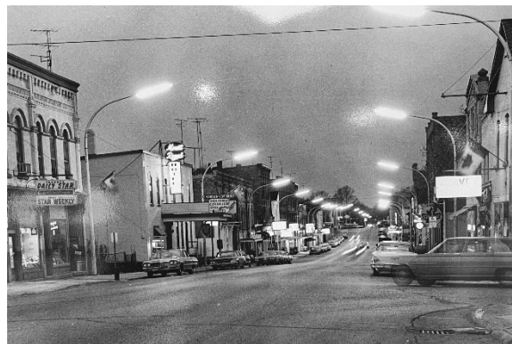
Main Street, Mount Forest in the 1950s.