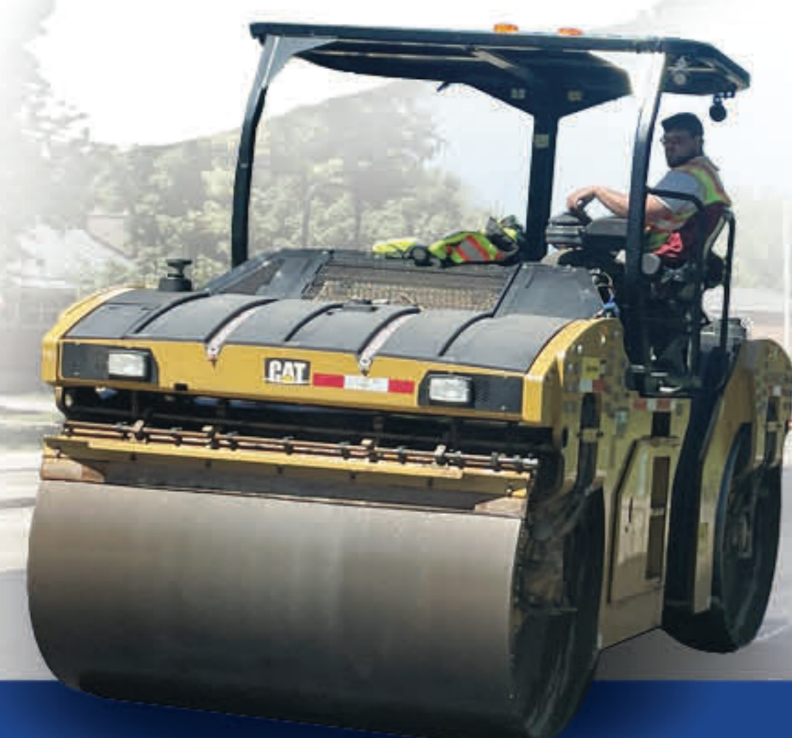
Paving of the newly reconstructed Smith Street in Arthur.