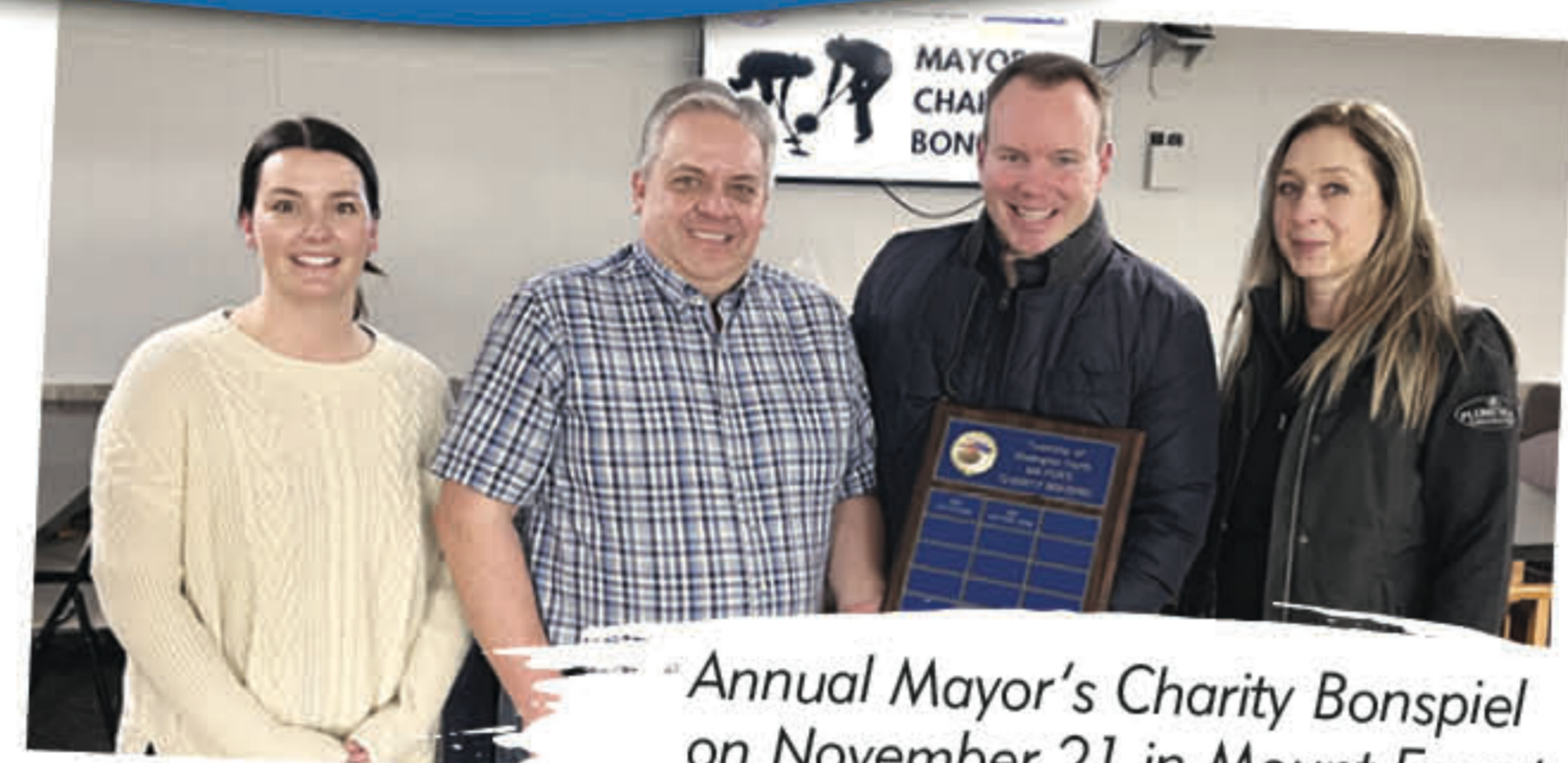
Annual Mayor's Charity Bonspiel on November 21 in Mount Forest