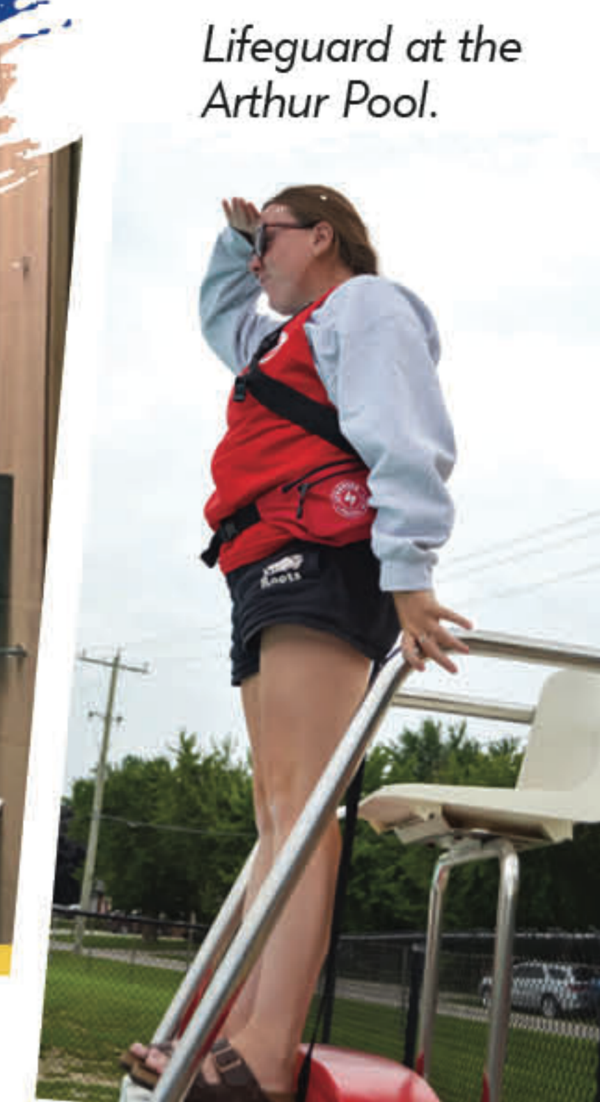
Lifeguard at the Arthur Pool.