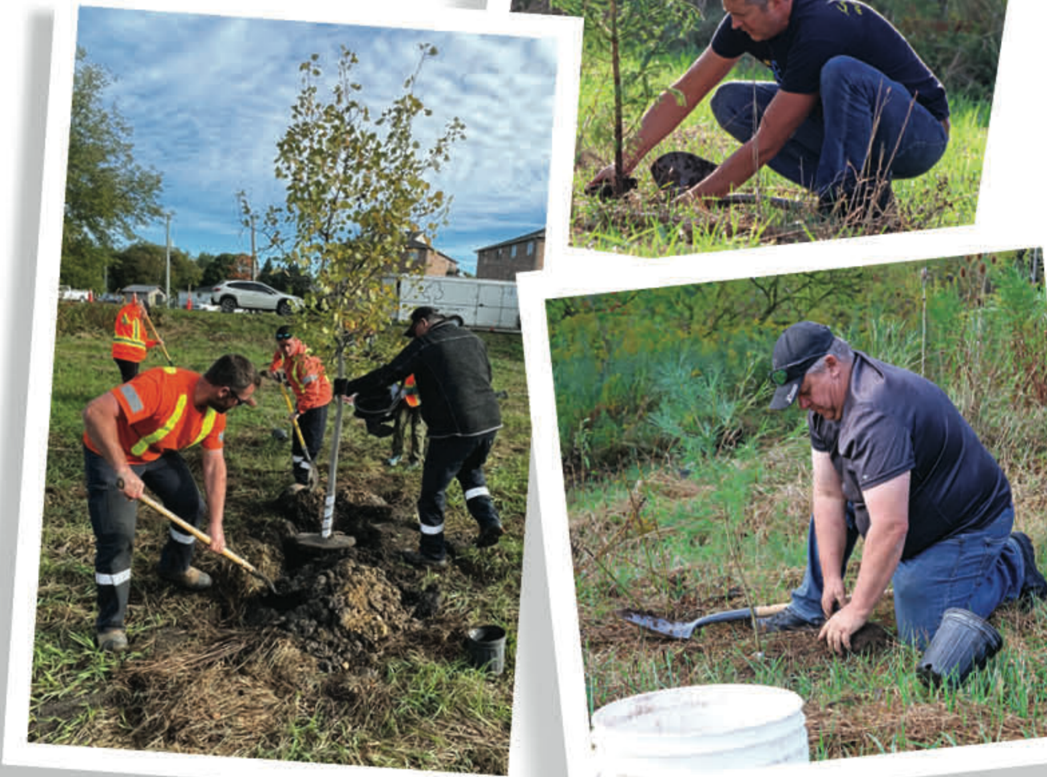
Warden's Tree Planting in Arthur, October 2

What's Next It's an exciting time in Wellington North!