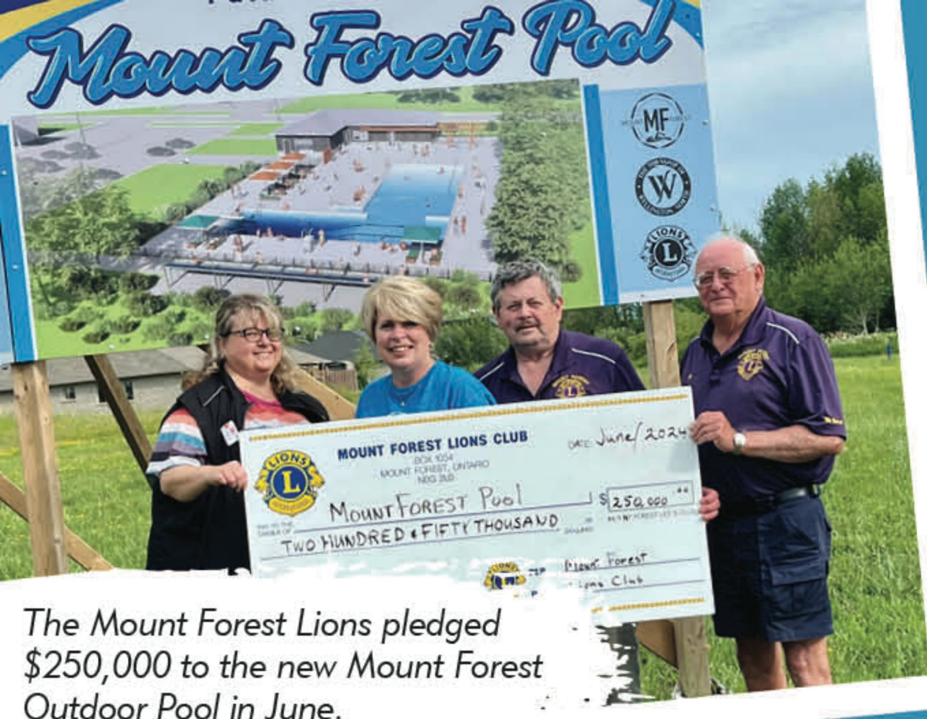
The Mount Forest Lions pledged $250,000 to the new Mount Forest Outdoor Pool in June.