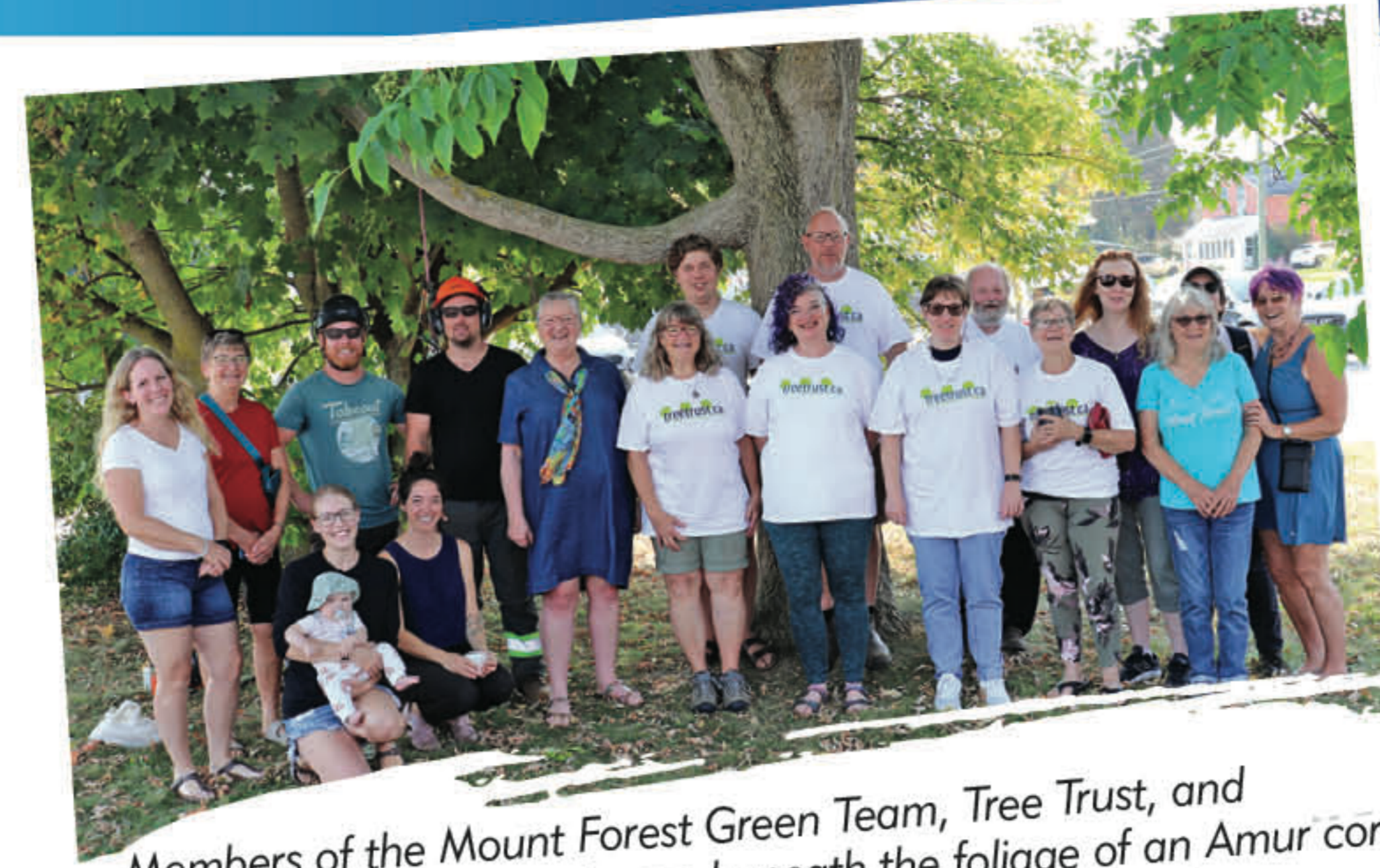
Members of the Mount Forest Green Team, Tree Trust, and Tober Tree Management pose beneath the foliage of an Amur cork tree, Mount Forest's first tree to be named Tree of the Year.