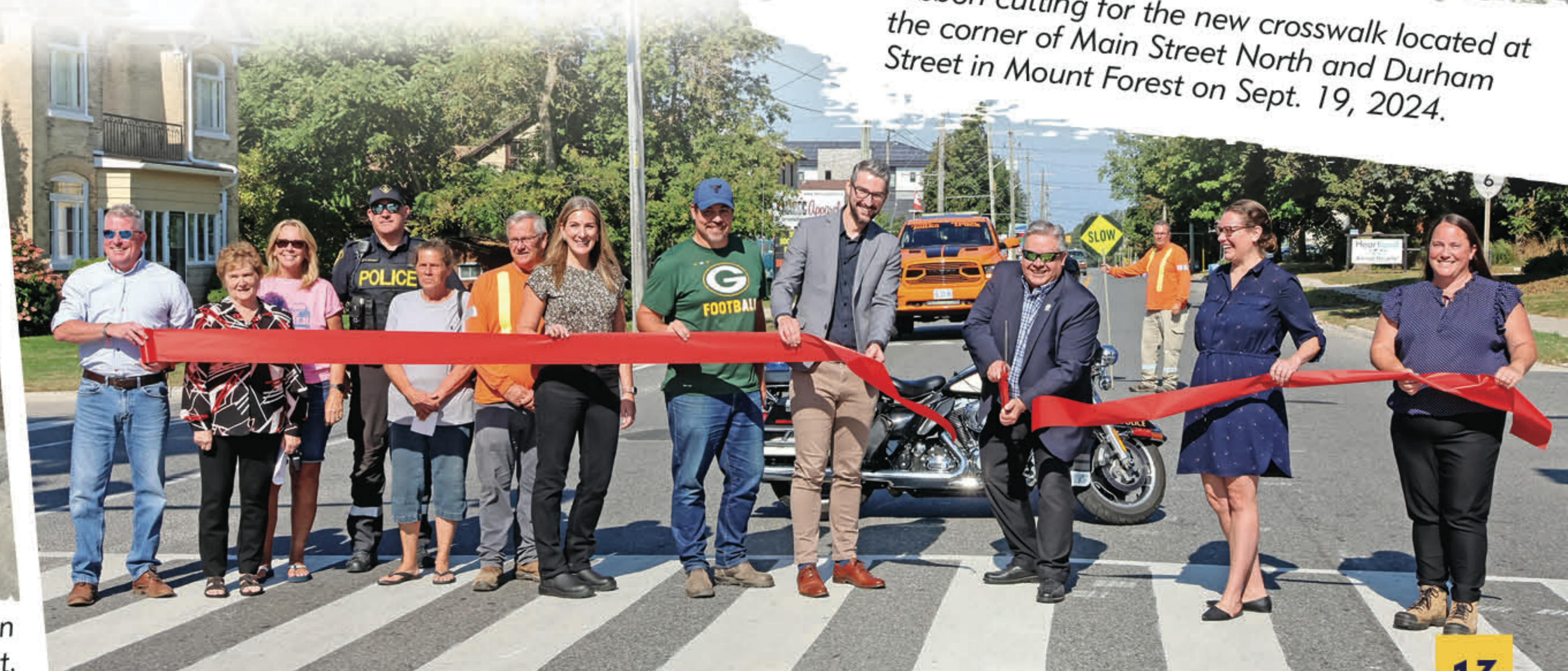
Ribbon cutting for the new crosswalk located at the corner of Main Street North and Durham Street in Mount Forest on Sept. 19, 2024.

62 Property Standard complaints received, 51 resolved. As of December 2024, 11 complaints were open with by-law officers working towards compliance with property owners.