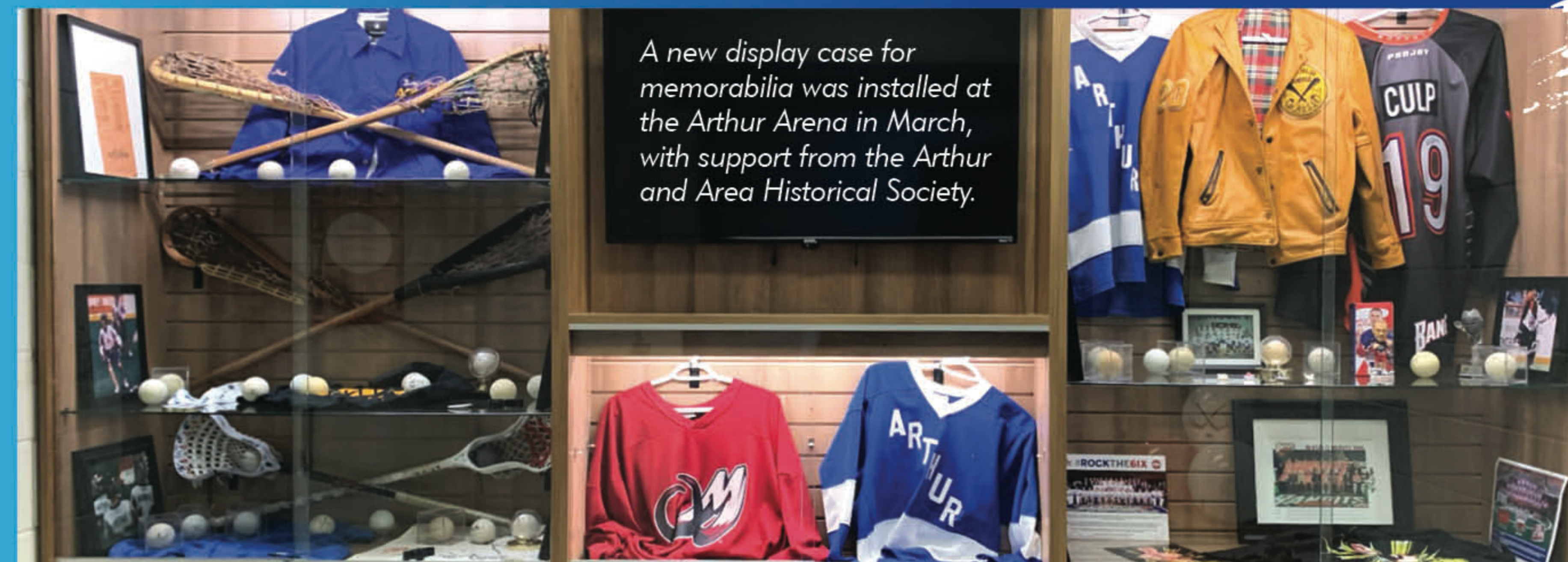
A new display case for memorabilia was installed at the Arthur Arena in March, with support from the Arthur and Area Historical Society.