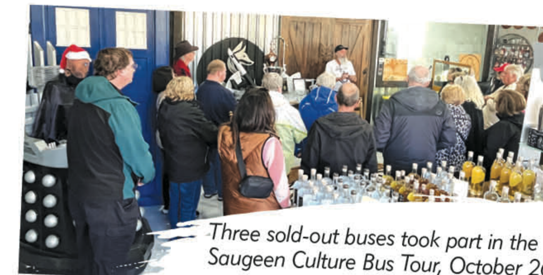
Three sold-out buses took part in the Saugeen Culture Bus Tour, October 26.