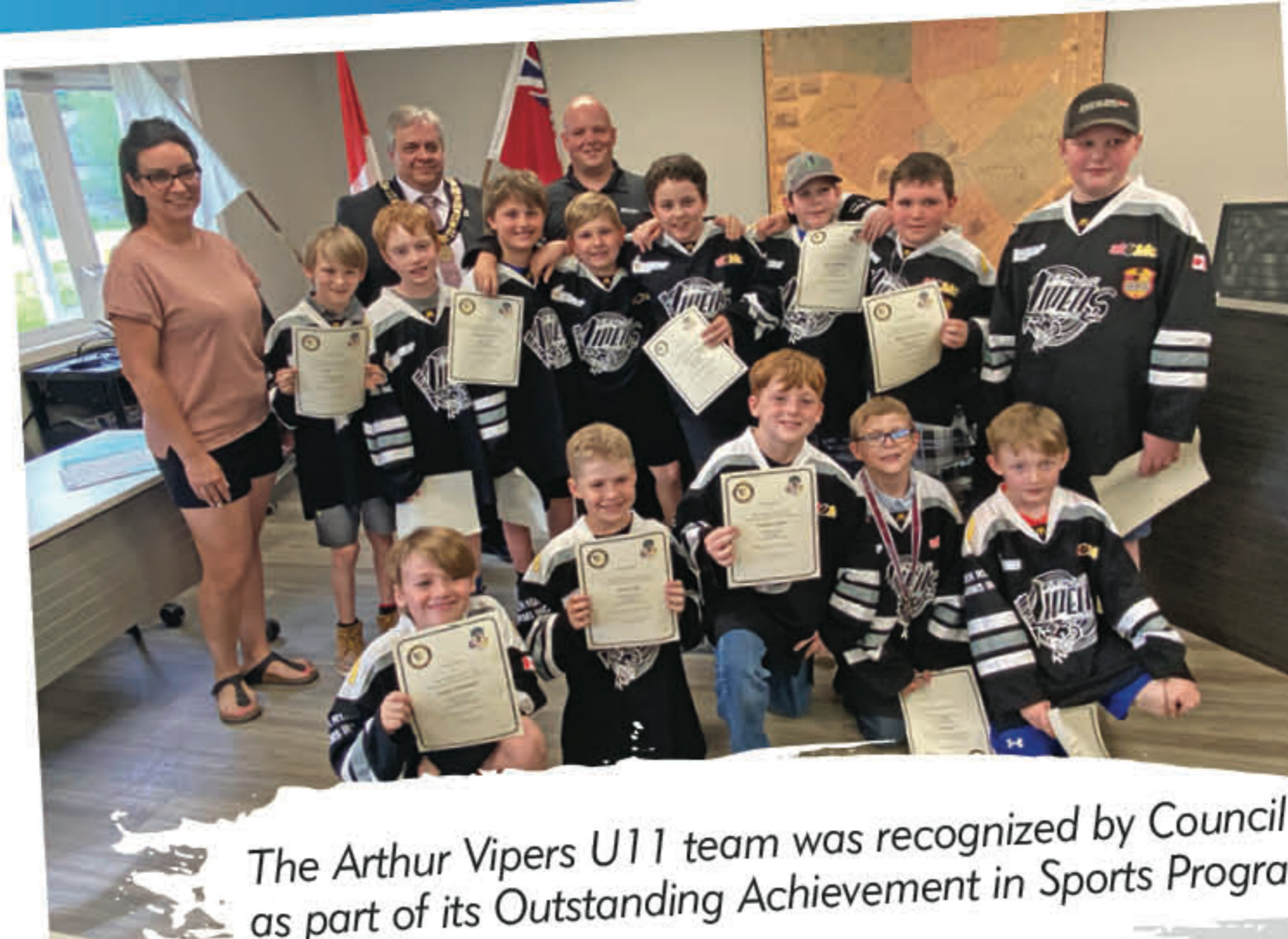
The Arthur Vipers U11 team was recognized by Council as part of its Outstanding Achievement in Sports Program.