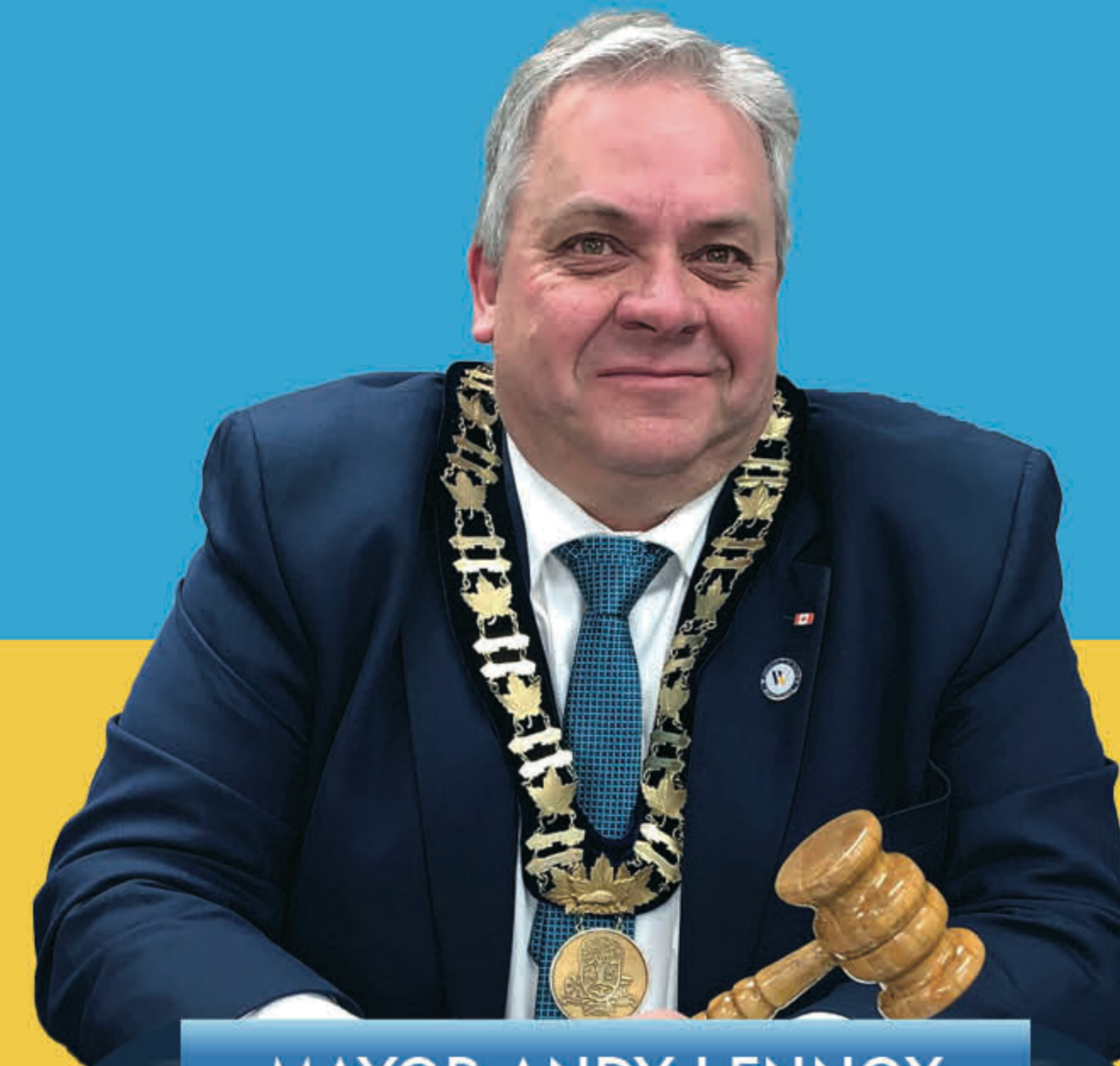
MAYOR ANDY LENNOX