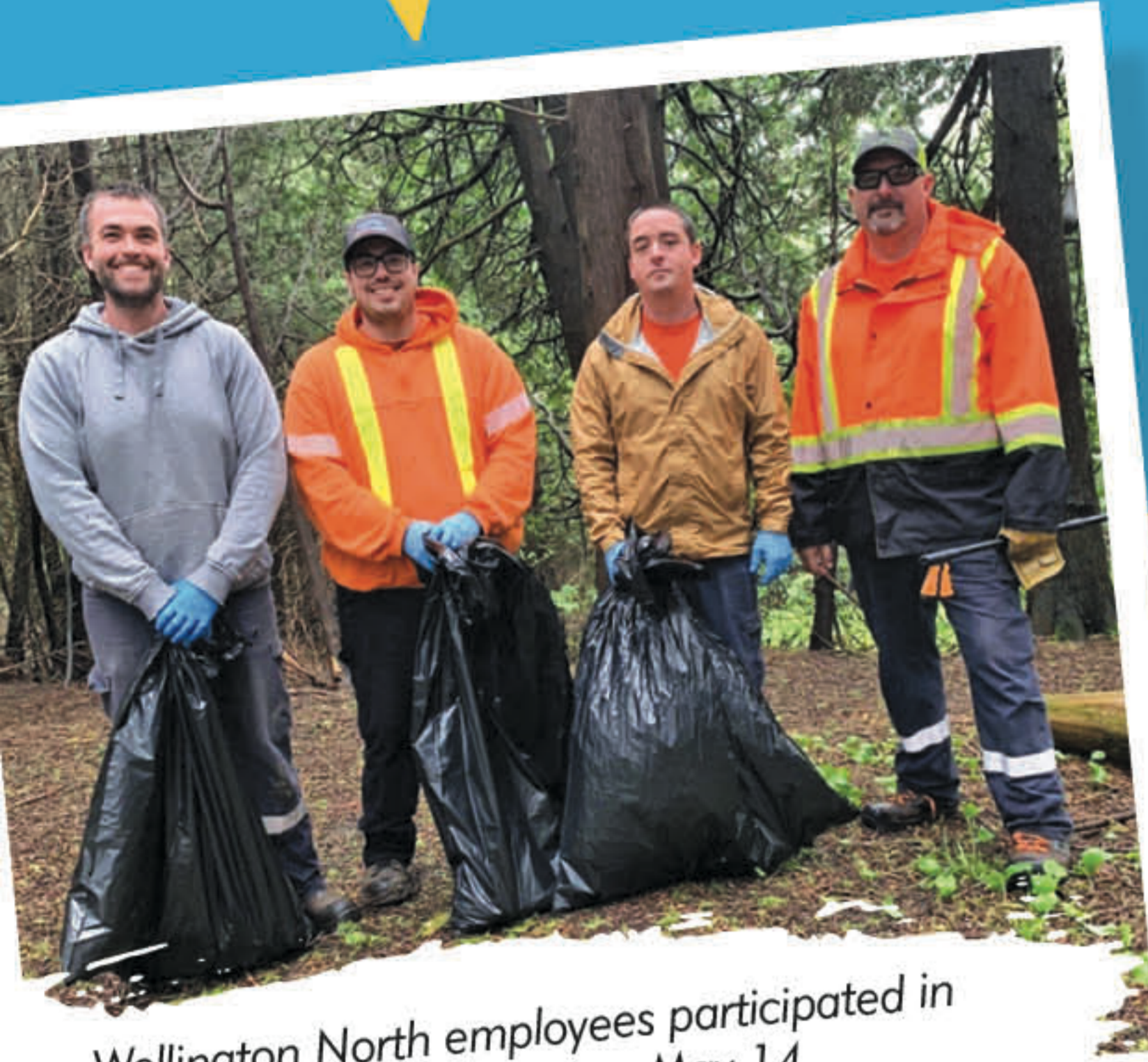
Wellington North employees participated in the Day of Action on Litter, May 14

2024 was focused on implementing the strategic plan. The following highlights some of the main actions the Township took in 2024 to address its priorities: