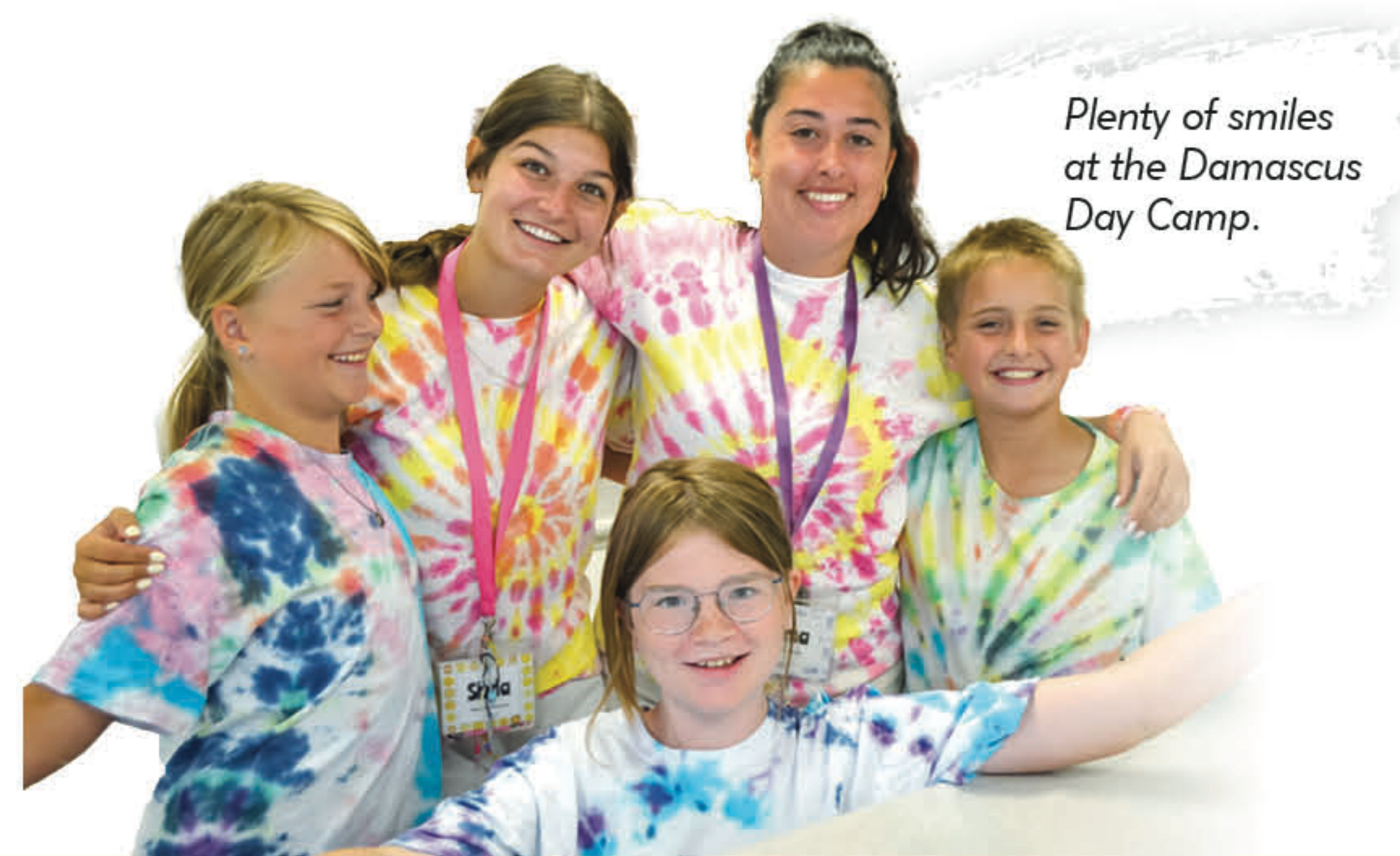
Plenty of smiles at the Damascus Day Camp.