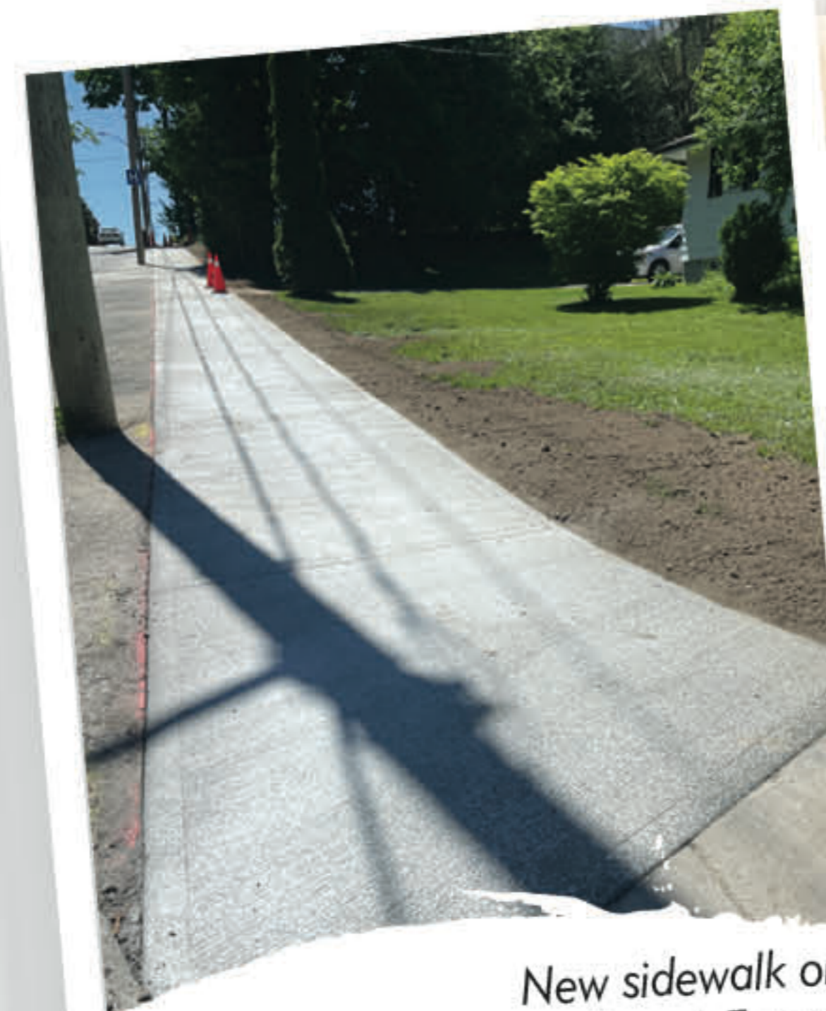
New sidewalk on Dublin Street, Mount Forest.