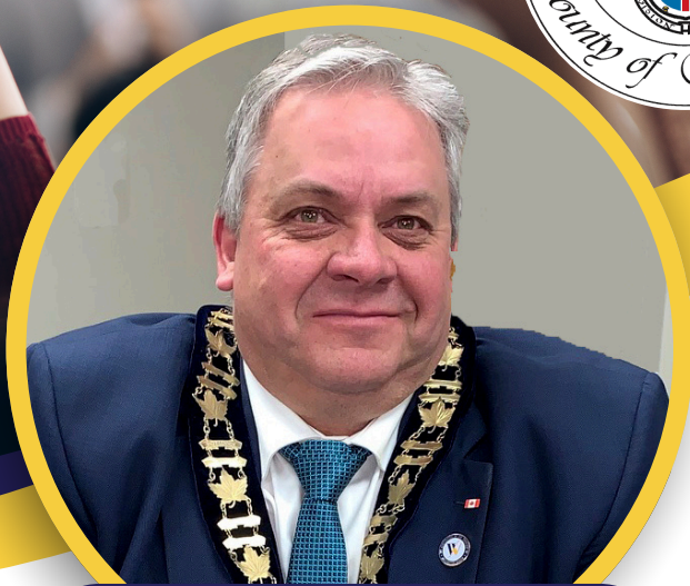
MAYOR ANDY LENNOX